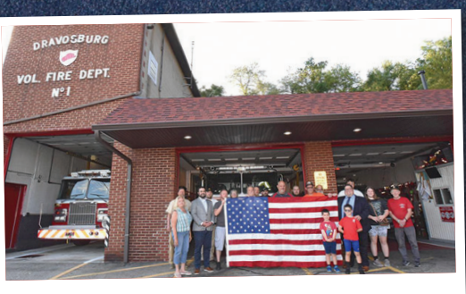
In September, I presented each of the fire companies I represent with a special flag that was flown over the U.S. Capitol in Washington, D.C., in memory of the lives lost on 9/11.